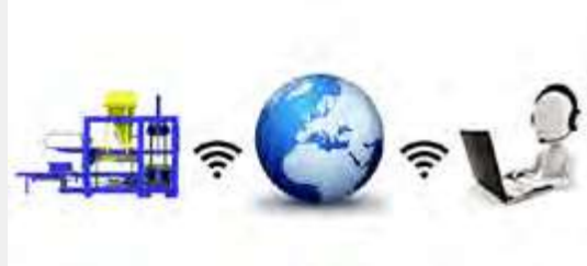
Online technical assistance