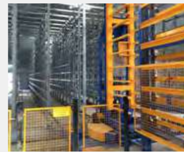
Rotation finger car